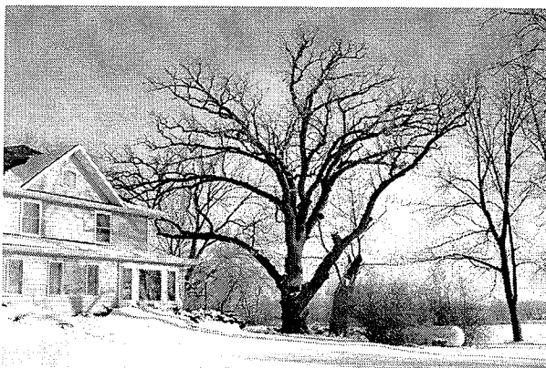
Town of Westport's trees. More in our next newsletter.